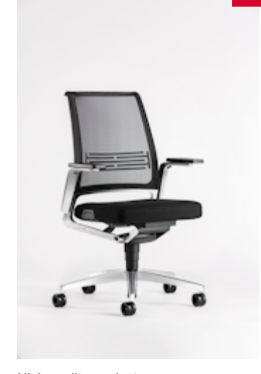
High quality product.

Exchange of parts free of charge within the guaranteed